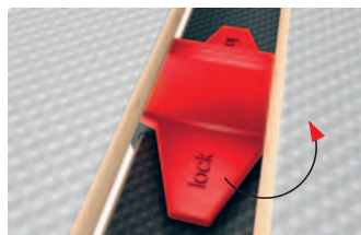
Middle zone reinforced.